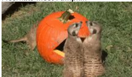
[video repeats after ~three seconds]