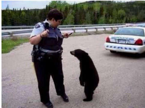
You wouldn't stop me if I were a polar bear.